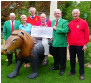
Julia's House Children's Hospice