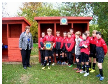
Shelters for Holt Junior FC