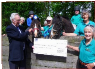
Riding for the disabled