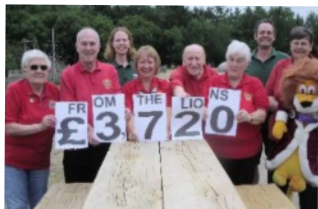
Avon Heath country park