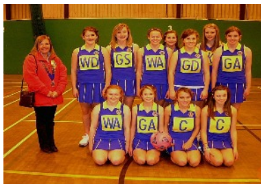
Ferndown School netball kit